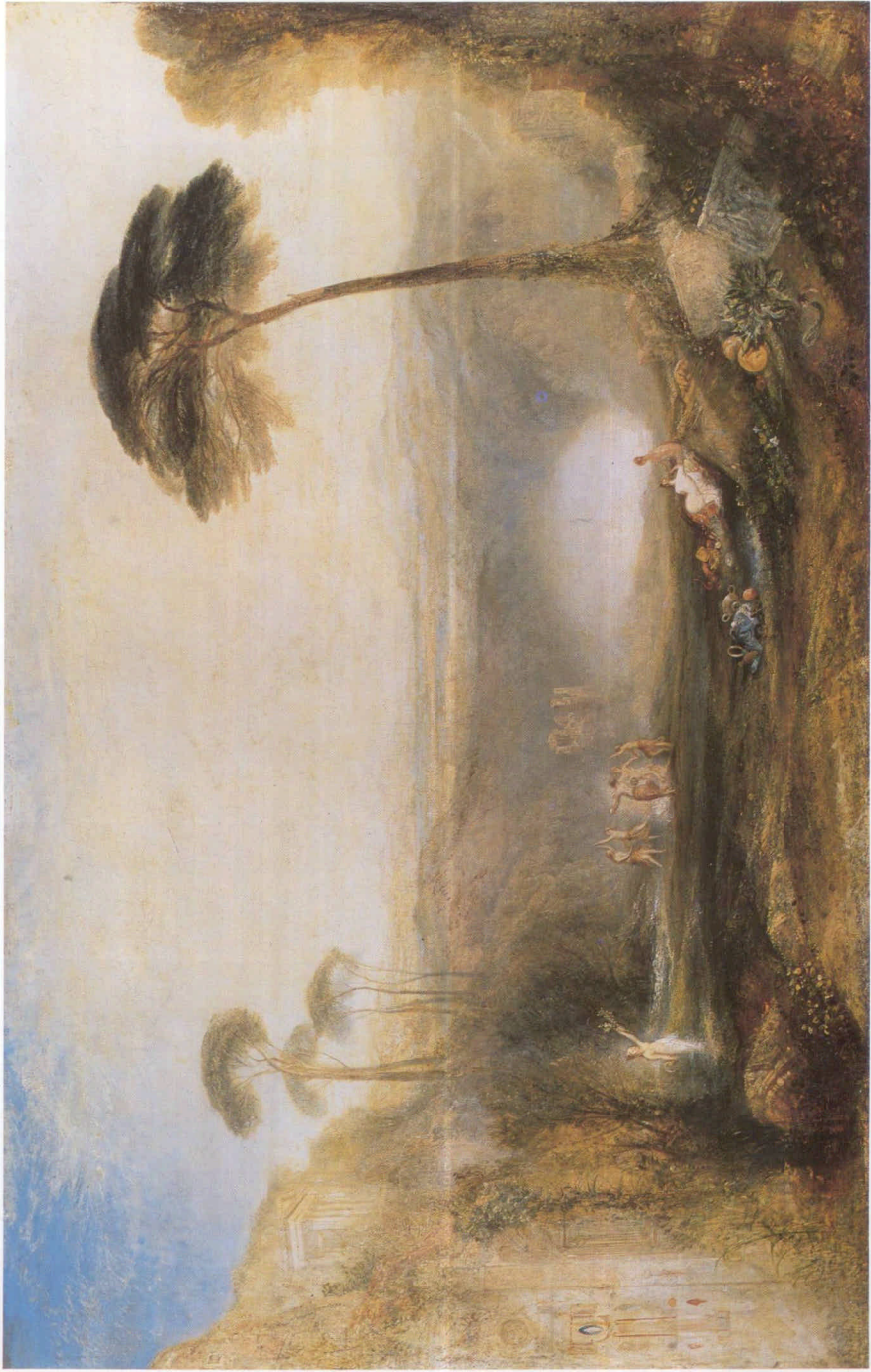
The Golden Bough